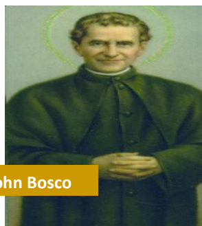
Saints Angela Merici, Thomas Aquinas & John Bosco