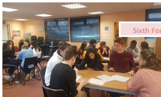
Sixth Form Leaders