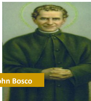
Saints Angela Merici, Thomas Aquinas & John Bosco

SJP is a proud Teacher Training Partnership School to Billericay Education Consortium and West Essex Teacher Training School Alliance. Please contact us if you are interested in a career in teaching and/or work experience.